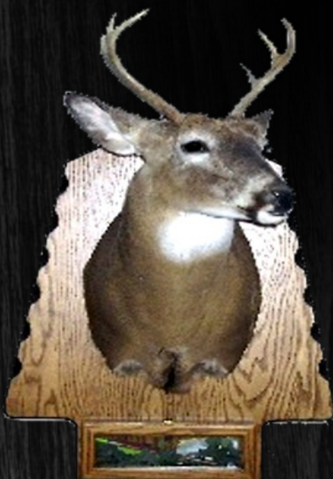
Arrow head model with glass memorabilia case Model # ANO-80-GC

These are big! Not only do they fit whitetails, they will also hold most other large game animals! Don't kid yourself, they look awesome on a Wagler plaque ( dress up your game room today )!