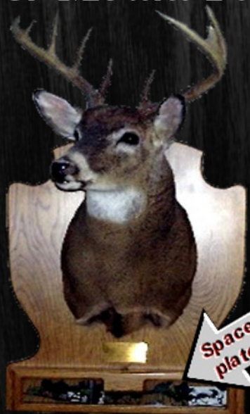
Trophy cup model with glass memorabilia case Model #TDO-60-GC

Space for engraved plate of it's scores!