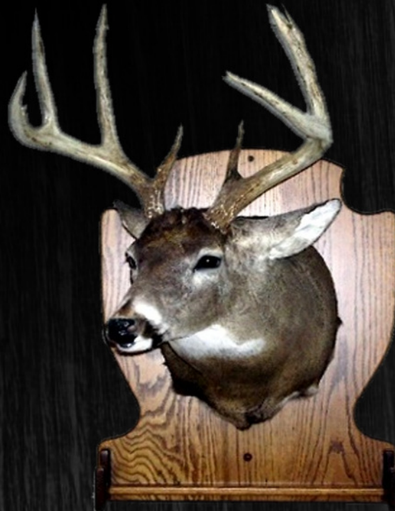
Trophy cup model with bow rack Model # TDO-60-BR