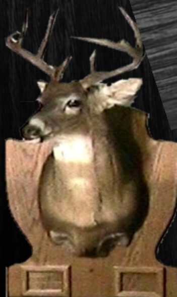
Trophy cup model with dual picture frames Model #TDO-02-PF

Space for engraved plate of it's scores!